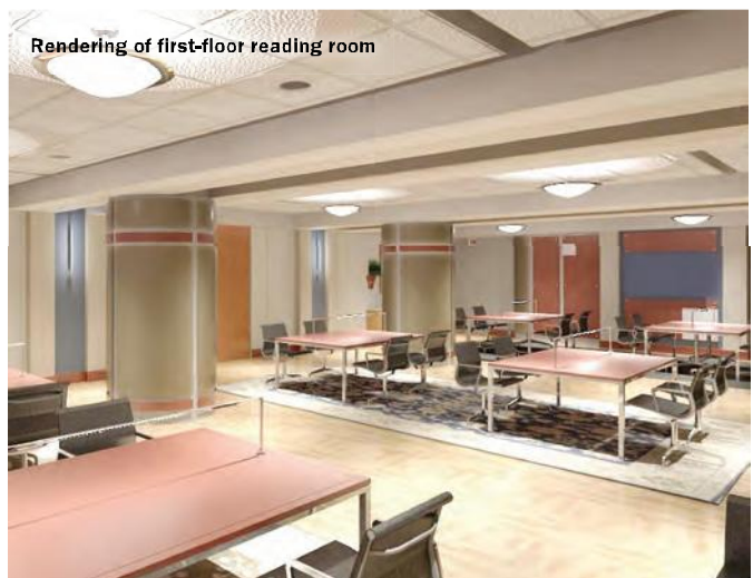
Rendering of first-floor reading room

There is, of course, space for general program purposes. There will be a student reading room, smaller and medium size classrooms, and new Placement offices that include dedicated interview rooms. Moving other administrative offices to the new facility will make room for a new large classroom in B.K. Roberts Hall. Construction is so far along that we hope to be moving in before December ends!