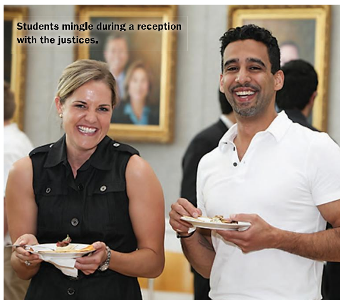
Students mingle during a reception with the justices.

The congeniality between members of Florida’s high court was apparent during Florida Supreme Court Day. The members in attendance enjoyed their time with students and each other, as evidenced by their ready laughter and humorous repartee. As the Q&A session ended, students were able to have one-on-one interaction with the justices during a reception in the Rotunda.