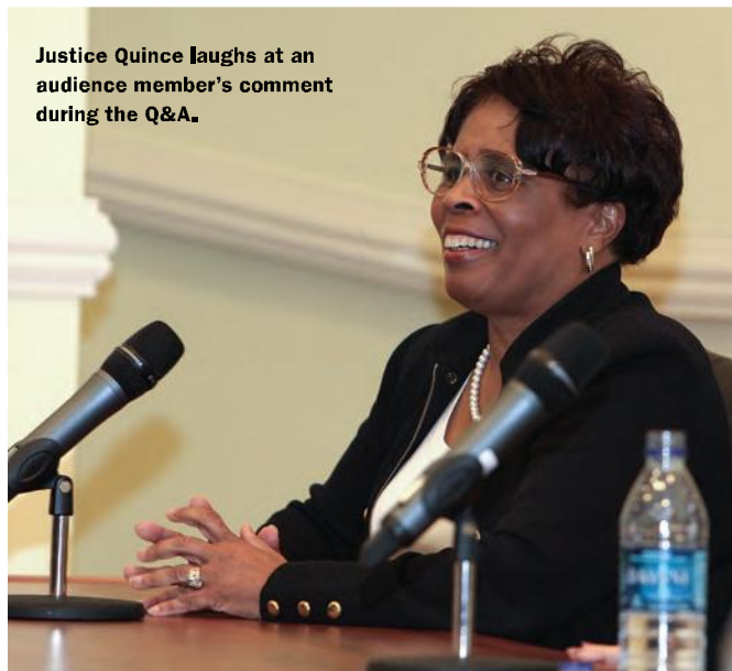
Justice Quince laughs at an audience member's comment during the Q&A.

“Florida Supreme Court,” continued from page 16