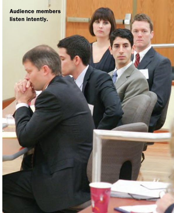
Audience members listen intently.