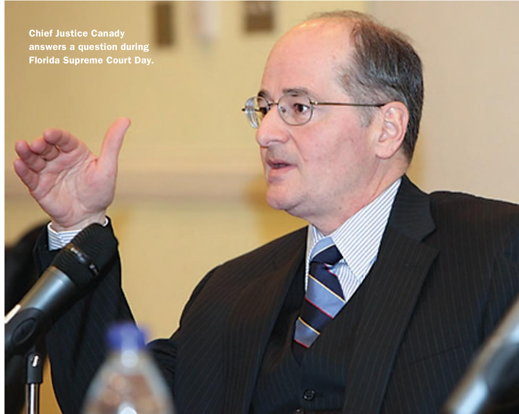
Chief Justice Canady answers a question during Florida Supreme Court Day.