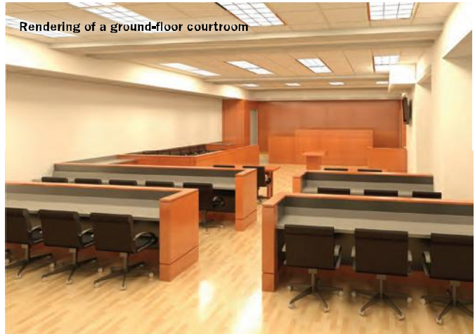
Rendering of a ground-floor courtroom

The new construction helps advance our program strength in three areas: trial and appellate advocacy, environmental law and public interest law. In the past 16 months, our Moot Court Team has won five, first-place national competitions and our Mock Trial Team has taken top honors in the Florida Justice Association competition. Our students, now patiently awaiting badly needed practice spaces, will soon have a completely refurbished historic courtroom and four smaller courtrooms in which to hone their craft. Each of the four smaller courtrooms will have a jury box and be suitable for use in either trial or appellate advocacy. We will now be in a position to proudly host regional and national mock trial and moot court competitions. The new building also will house our environmental law faculty, who will be located next to the student editors of the Journal of Land Use and Environmental Law . They will be side-by-side in a way that underscores the collaborative nature of a legal education at Florida State and why our Environmental Program has been rated 6th best in the nation by U.S. News . Finally, the new building contains a new suite of offices for our Public Interest Law Center, which has won national and international attention, especially for its work with children.