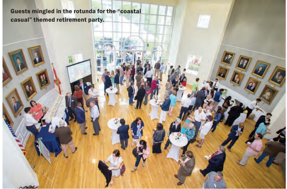
Guests mingled in the rotunda for the “coastal casual” themed retirement party.