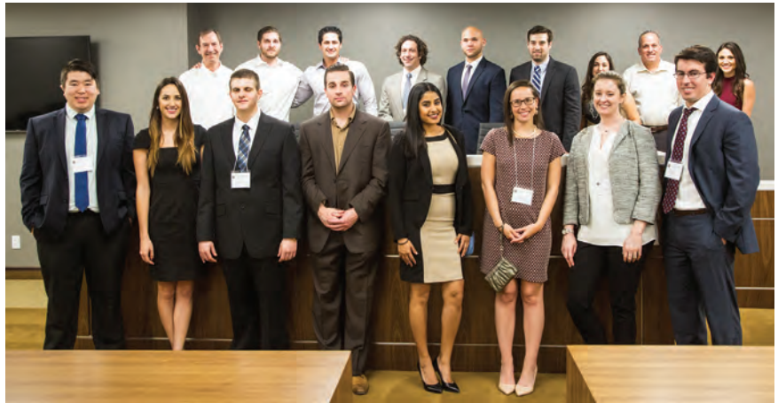
(ABOVE) Students and alums gathered for a networking reception in South Florida.