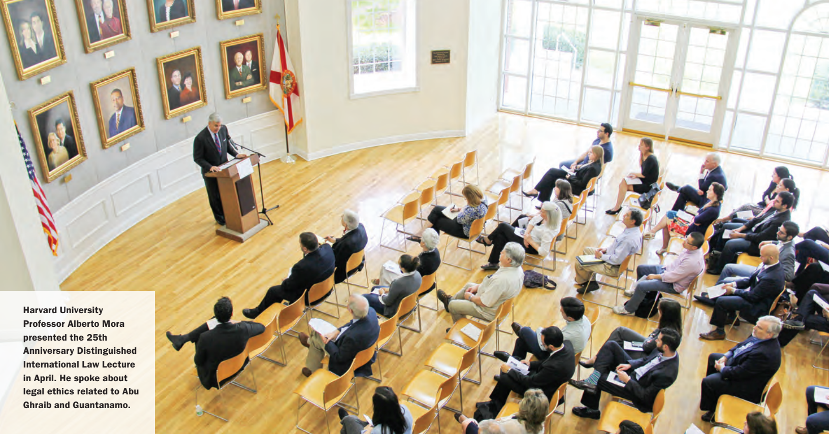
Harvard University Professor Alberto Mora presented the 25th Anniversary Distinguished International Law Lecture in April. He spoke about legal ethics related to Abu Ghraib and Guantanamo.