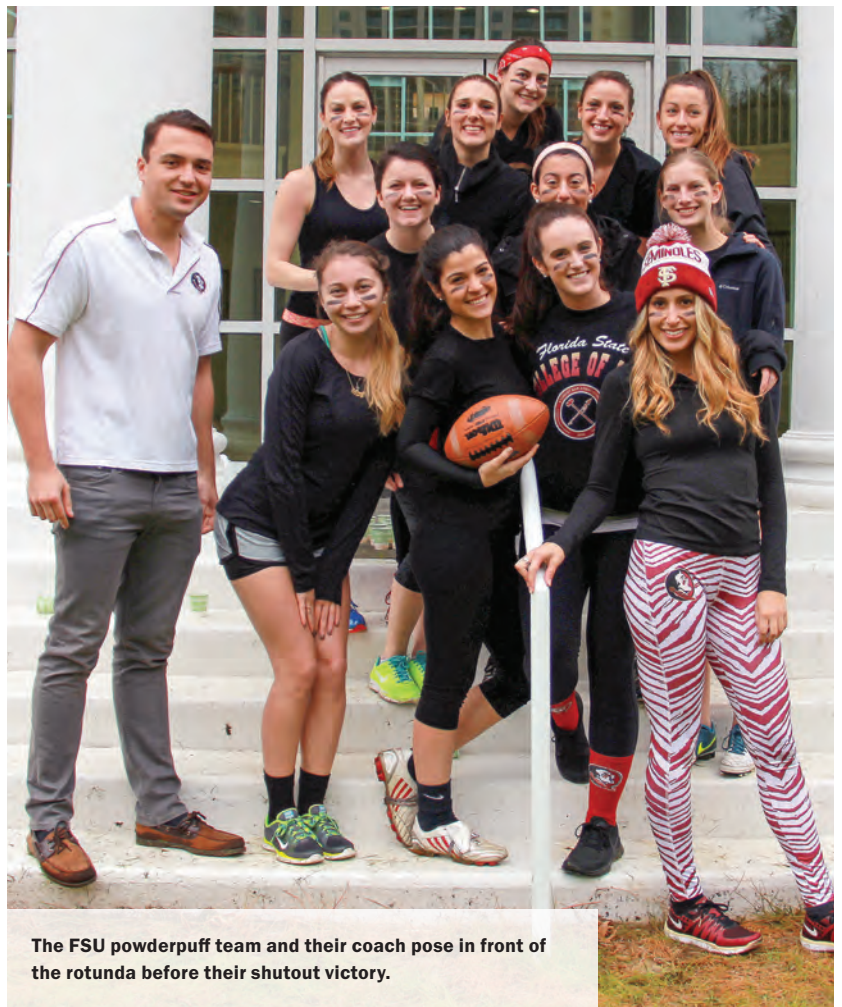
The FSU powderpuff team and their coach pose in front of the rotunda before their shutout victory.

Students enjoyed a fun afternoon of powderpuff football on the law school green on January 28. The annual event pits fans of Florida State University against fans of the University of Florida and usually coincides with the week of the FSU vs. UF football game, but was postponed due to inclement weather. The FSU team was victorious, beating the UF team 16-0.