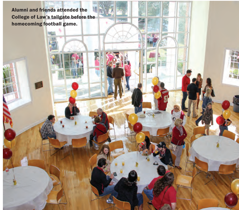
Alumni and friends attended the College of Law's tailgate before the homecoming football game.

On Saturday, November 14, the College of Law concluded its festivities with a tailgate party before the FSU football game against North Carolina State University. The event was sponsored by alumni who contribute to the Annual Fund.