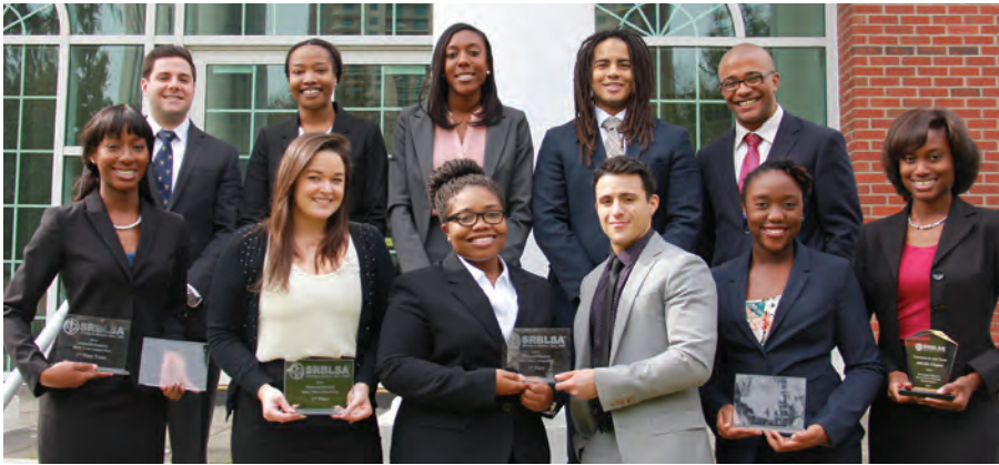
BLSA regional competition winners pose with their awards in front of the College of Law rotunda.

The College of Law's Black Law Students Association (BLSA) again received the national Chapter of the Year award in the mid-size category. The award was presented on Sunday, March 13 at the National Black Law Students Association's 48th Annual National Convention in Baltimore, Maryland. Other law schools competing for the award included the University of Florida and William & Mary. The award is based heavily on an organization's community service and educational outreach activities. BLSA competed for the national title after winning the regional award in January, marking the fifth time in seven years that Florida State won the regional title.