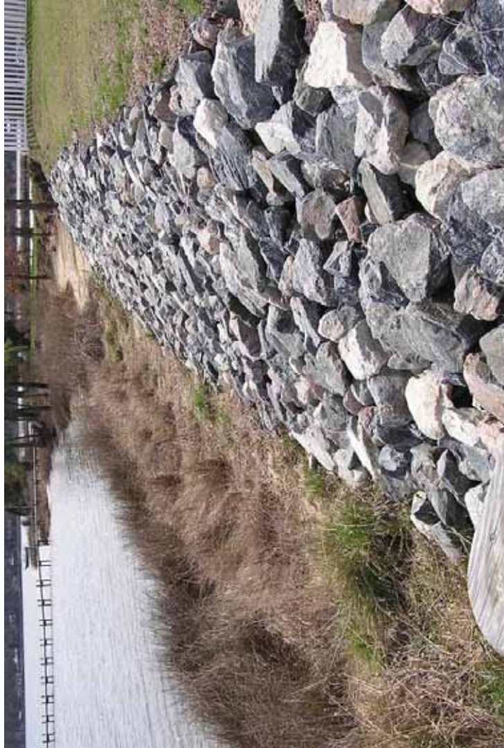
Conventional Revetment